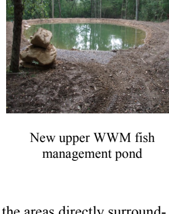
New upper WWM fish management pond

Our main concentration was on the new 1/3 acre pond and the areas directly surrounding it. We began with reclamations of the land for the pond from an old dumping ground. Then work progressed to the pond excavation and revamping the fresh water main stream feed. The source for this feed is from the head waters of the Loyalhanna stream. 2 limestone dams were then implemented into this main stream supply area, which allowed for a natural in stream settling pond to form in front of each dam. These dams also provide a filtration system, while the limestone acts as a pH balancing agent.